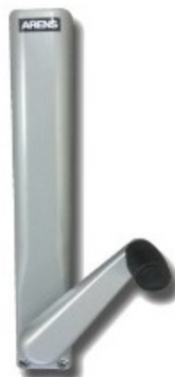
MDCR 209 GEAR BOX